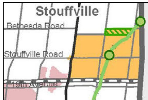
Expansion lands showing current Metrolinx Stations

c. Nicolleta and Frank Tarulli, owners of 6431 Bethesda Sideroad via dolores@trentaduetorres.com