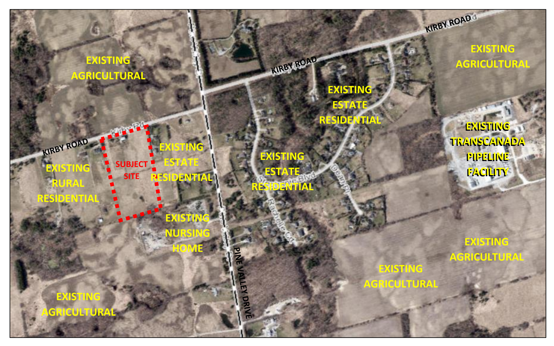
Attachment 2: Site Context