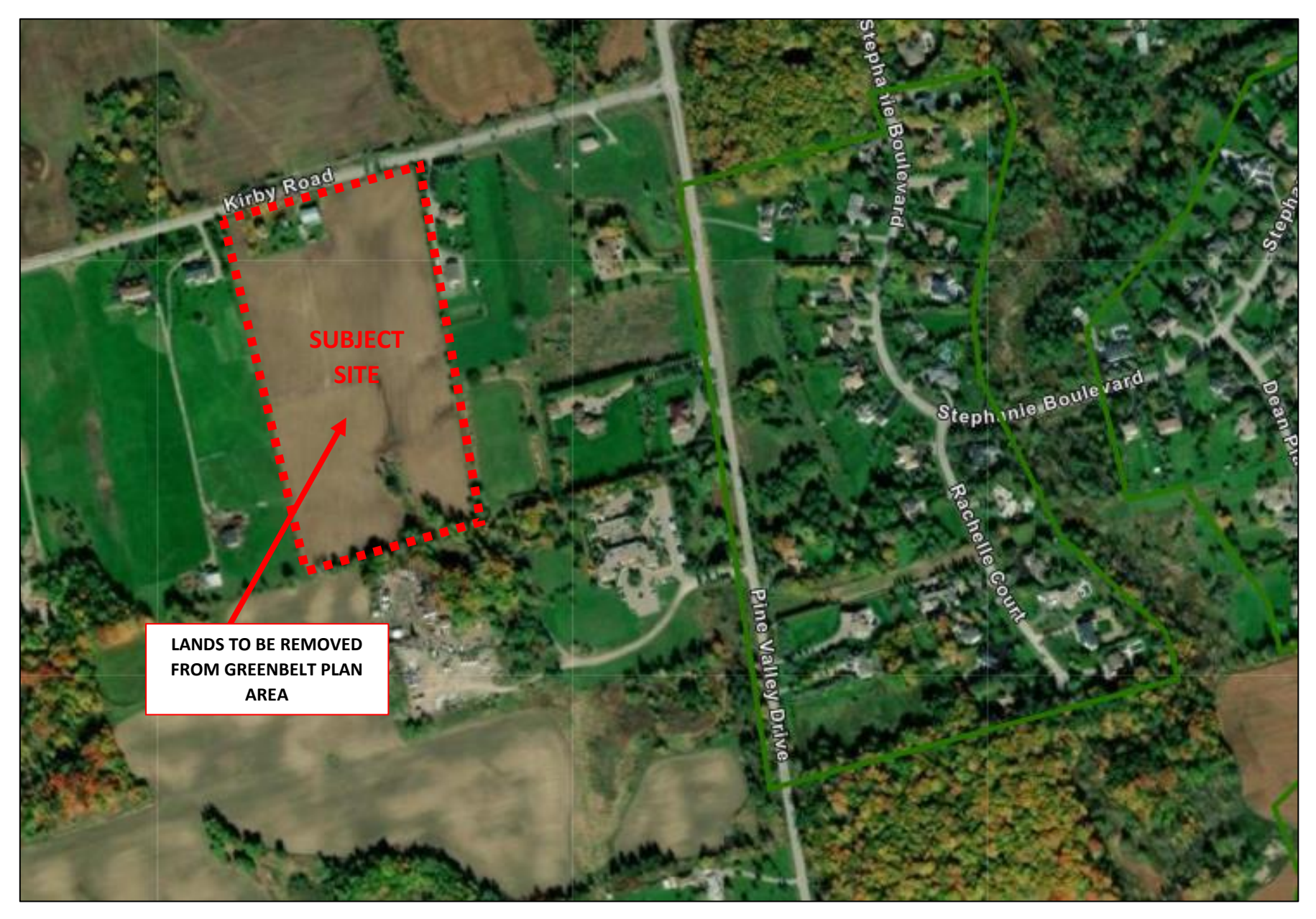
Attachment 4: Proposed Amendment to the Greenbelt Plan Area Boundary