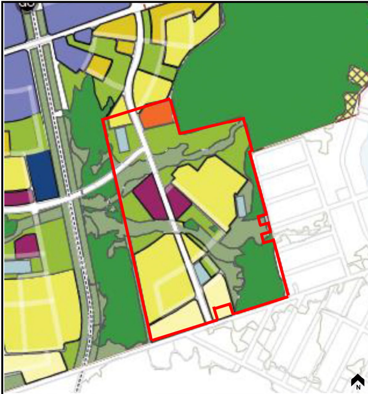
FIGURE 2: DRAFT SECONDARY PLAN – SUBJECT LAND USE