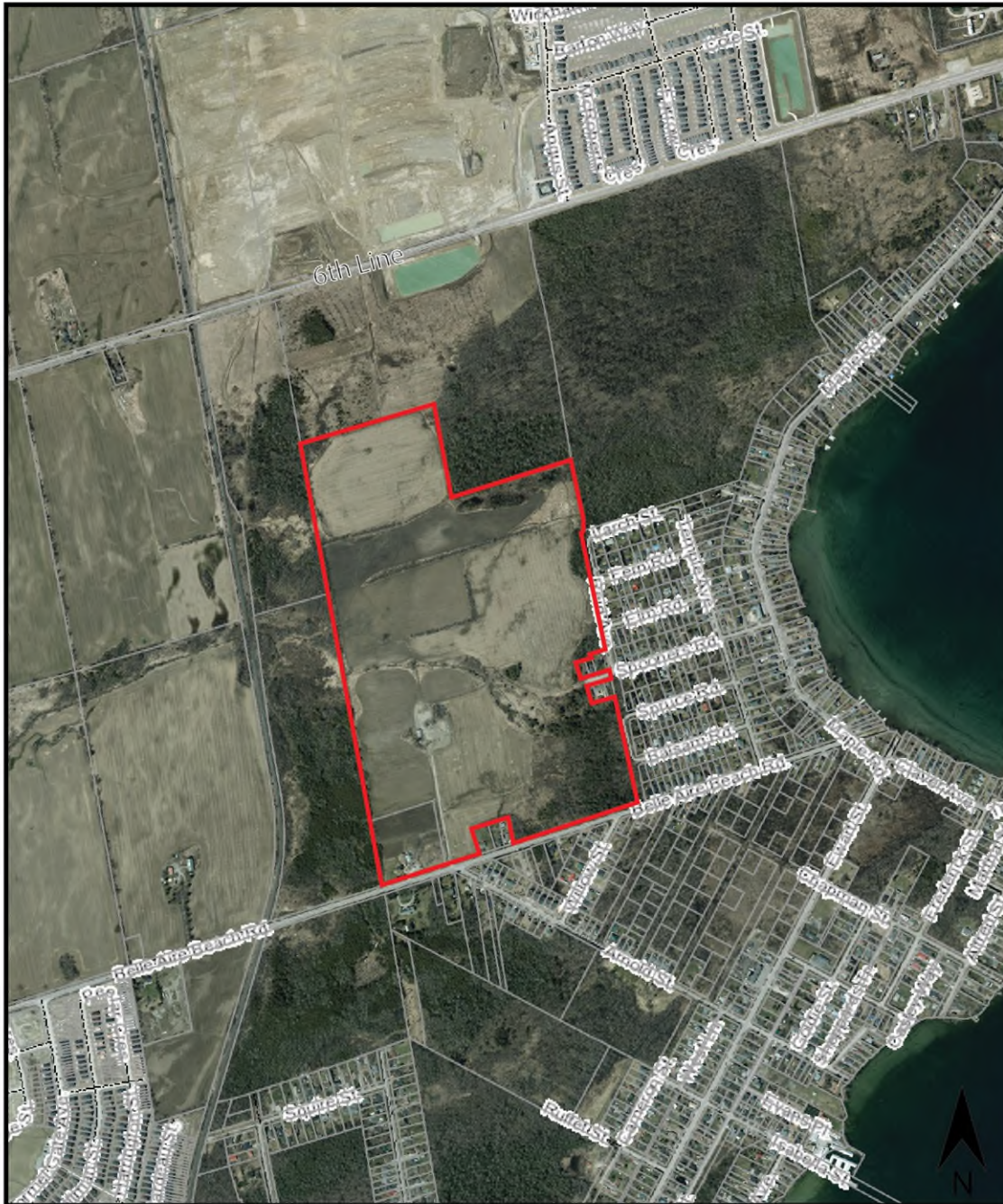
FIGURE 1: LOCATION OF SUBJECT LANDS