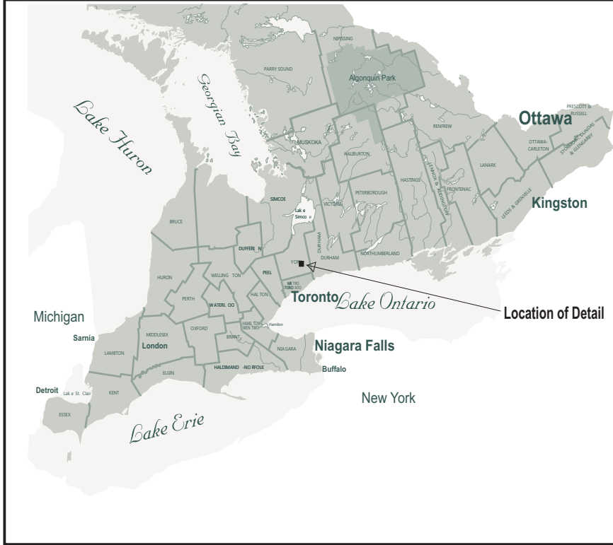
FIGURE 1 Location Map

HPI Memorandum for 4721 Stouffville Road, Whitchurch-Stouffville